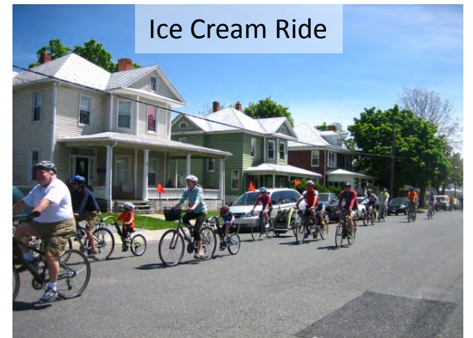
Ice Cream Ride