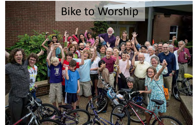
Bike to Worship