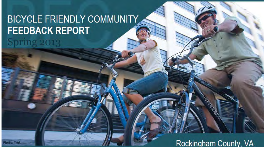
Rockingham County, VA

BICYCLE FRIENDLY COMMUNITY FEEDBACK REPORT Spring 2013